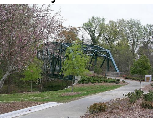
Greenville greenway: Tar River pedestrian bridge

A bicycle and pedestrian trail connecting the City of Washington with the City of Greenville