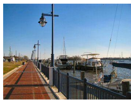
Washington waterfront

A bicycle and pedestrian trail connecting the City of Washington with the City of Greenville